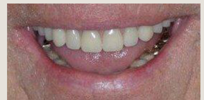
Restores smile and function