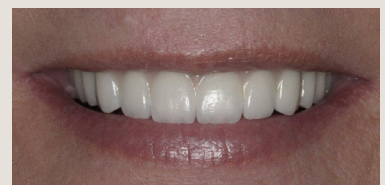
Builds back smile