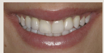
Build back your smile