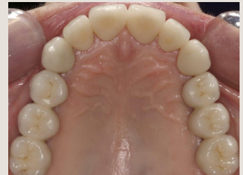
Build back your bite