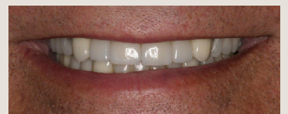
Restores smile and function