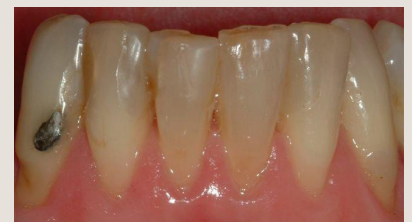
Examples of silver fillings